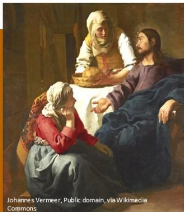
Johannes Vermeer, Public domain, via Wikimedia Commons

This Sunday's image of the life the risen Christ shares with us is the image of friendship.