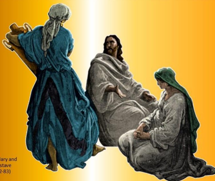
Jesus with Mary and Martha—Gustave Doré (1832-83)

Please visit us at: https://clcmillvale.com