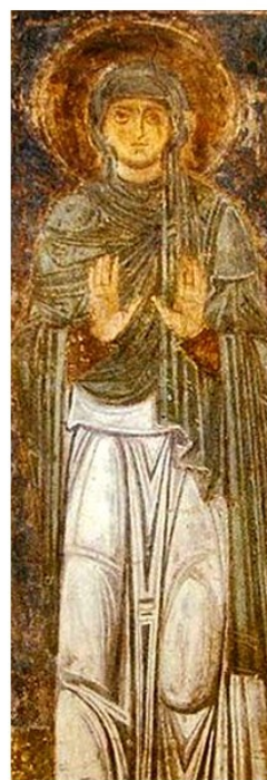
St. Macrina the Younger

Macrina, older sister of Basil and Gregory of Nyssa, was the leader of a community dedicated to asceticism, meditation, and prayer.