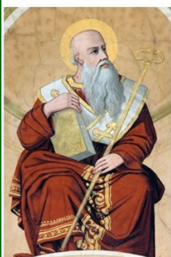
St. Gregory of Nazianzus

The Cappadocian fathers, as the three men in this group are known, explored the mystery of the Holy Trinity. Basil's monastic rule forms the basis for Eastern monastic life. Gregory of Nazianzus defended orthodox Christianity in Constantinople. Gregory of Nyssa, Basil's younger brother, wrote on the spiritual life.